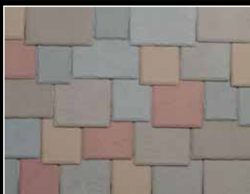
Vineyard Blend A warm mosaic of earthen tans and grays accentuate the warm purples reminiscent of provincial Tuscan hillsides.