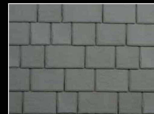
Slate Gray Very stately, classic and distinguished, this popular color choice is broad in appeal and applications. (Shown with straight coursing option.)