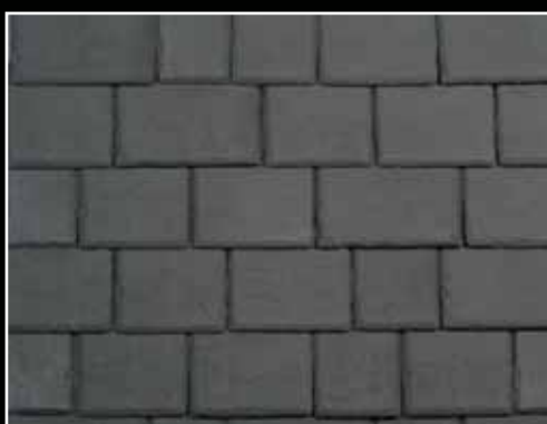
Slate Black This regal, raven-pure color reflects a boldness of simplicity, putting the final exclamation on elegance. (Shown with straight coursing option.)