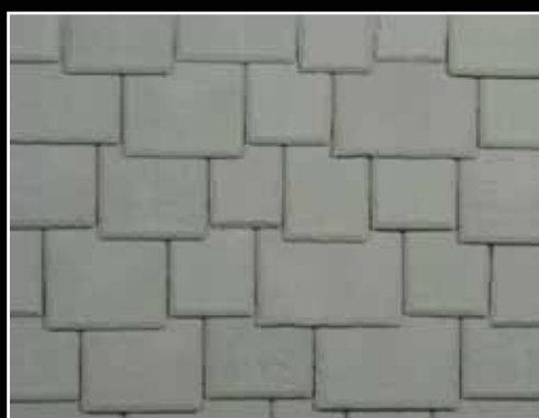
Evergreen Blend Scenically inspired shades of misty gray-greens and pine greens, reminiscent of an alpine forest, make this a natural choice.