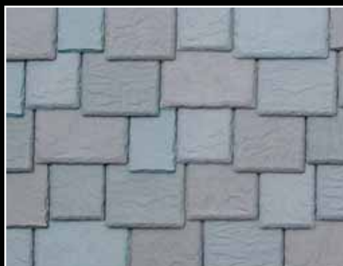
Brownstone Blend The best of both worlds; warm grays and lively browns unite to form a modern classic.