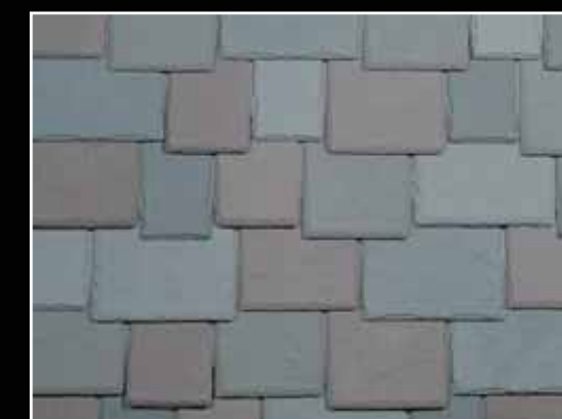
European Blend The timeless allure of Old World heritage and centuries of nobility are captured in rich, warm grays and purples.