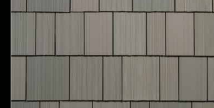
Weathered Gray Blend Weathered Gray Blend conveys the natural warm wood tones that maintain a timeless beauty. (Shown with straight coursing option.)