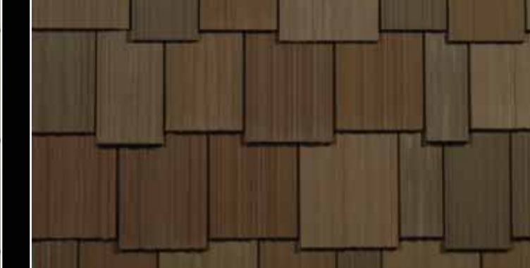
Tahoe Blend The deep rich earth tones of Tahoe Blend will enhance the natural beauty of any home.