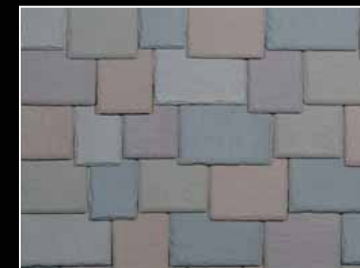
Aberdeen Blend This unique, color-patchwork medley recreates the captivating charm of a quaint country inn with earthy browns, grays, subtle greens and purples.