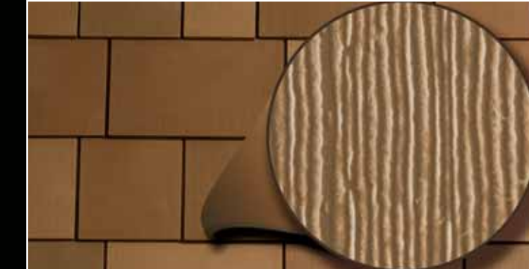
Fancy Shake Autumn Fancy Shake shingles deliver a more refined appearance than a traditional hand-split cedar shingle.