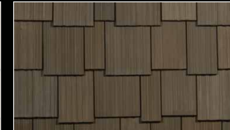
Mountain Blend No matter where you are, you can enjoy the enduring beauty of the wide open spaces with the rugged Mountain Blend.