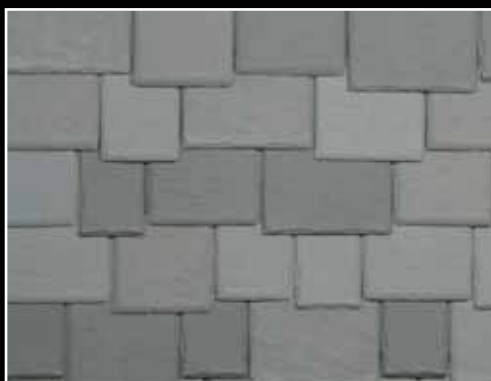
Castle Gray Blend This medieval, majestic blend, imbued with natural slate gray tones, is a most fitting crown for any home.