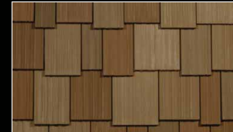
Autumn Blend Year after year, capture the fresh crispness of fall with the rustic Autumn Blend.