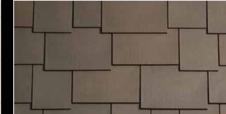
Fancy Shake Mountain Available in Autumn (shown), Mountain (shown), Tahoe, and Weathered Gray blends.