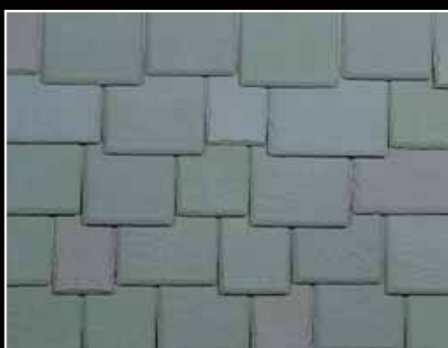
Weathered Green Blend Verdant and sylvan greens, grays and tan are interlaced in a naturally pleasing, earthy and pastoral pattern.